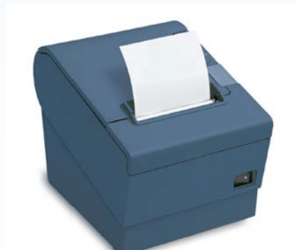
Thermal Receipt Printer