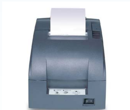
Dot Matrix Receipt Printer

Receipt printers provide your patrons with their current circulation information after each transaction and can provide receipts for payment of fines and/or other charges. Thermal Label Printers are used for printing highly durable polyester barcodes (single or multiples).