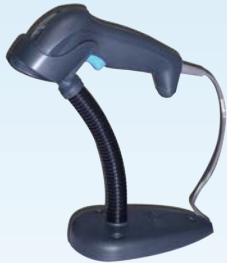
Stationary Linear Imager